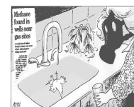
Methane in Wells