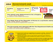
(454) Government seal