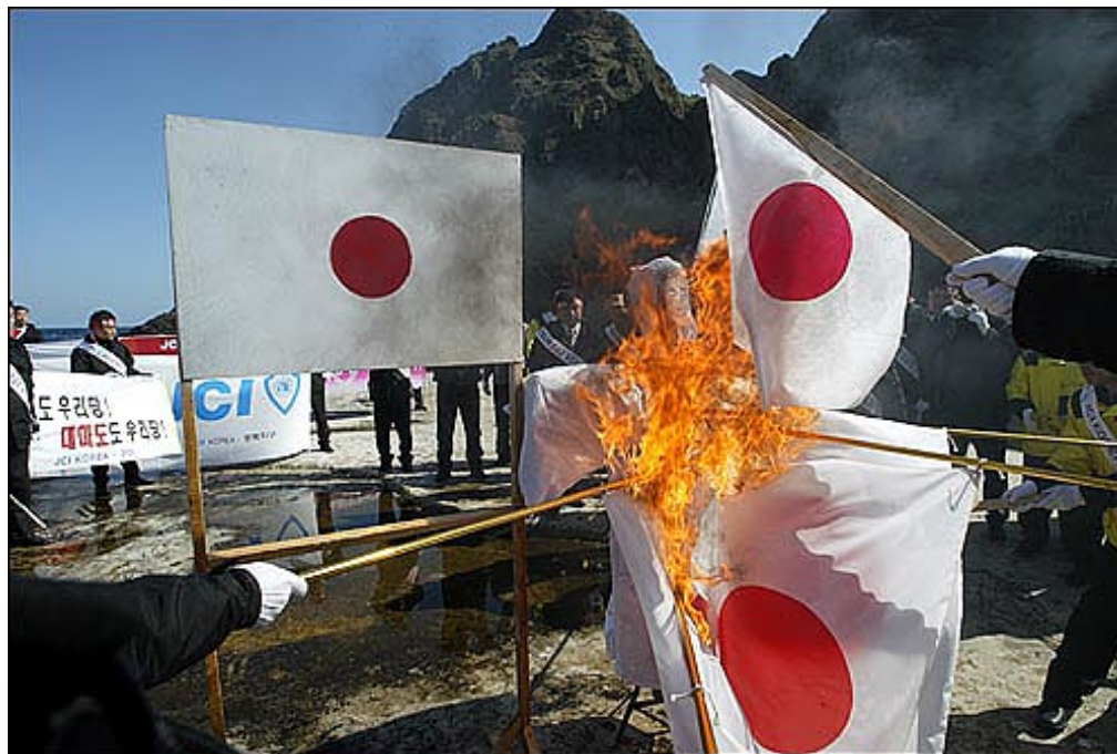
▲ South Korean protestors burn the Japanese flag on the disputed island between Korea and Japan, Feb.19.